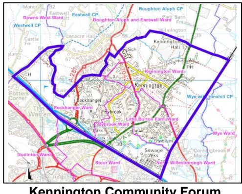
Kennington Community Forum